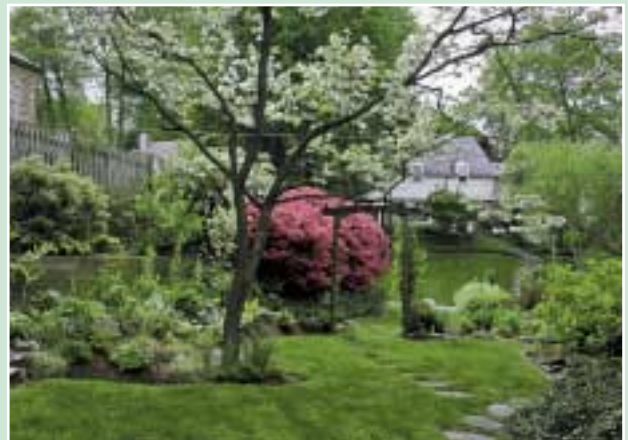
The author's view from her kitchen window in spring.

The other rooms of my house that have lovely views are my dining room and the upstairs master bathroom. Just outside the dining room is a magnificent old flowering crabapple ( Malus floribunda ) whose branches are so architecturally arresting that I've never wanted to screen them from view through the bay window, which has no curtains or any other "treatments." Even when it's not in bloom, the sight of this tree