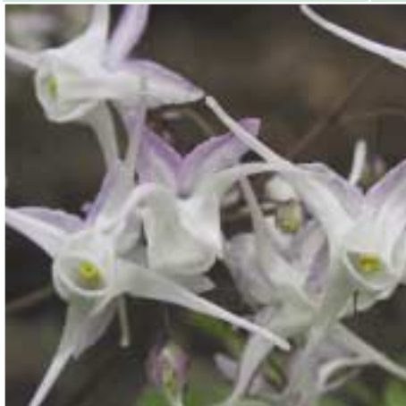
Epimedium ‘Lilafee’ in bloom in April

REMEMBER that orders for spring and summer annuals are due by April 6th. Please contact us if you have any questions about your orders. Thanks!